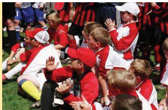
Six a Side Football Tournament, Oaksey Fun Day 2004